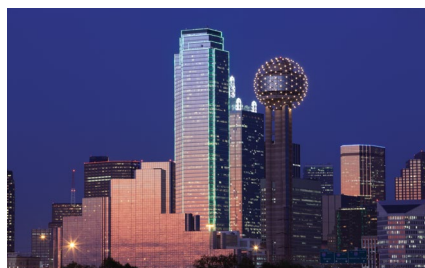
Reunion Tower Dallas (1978)