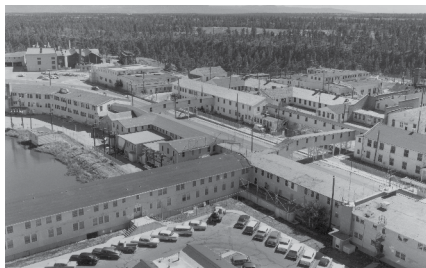
Los Alamos New Mexico (1943)