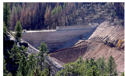
Los Alamos Dam New Mexico (2000)