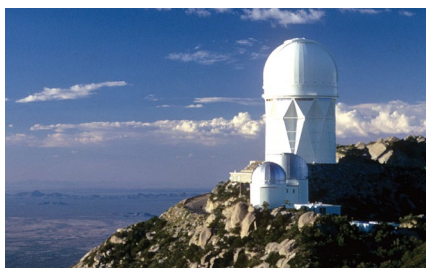
Kitt Peak Observatory Southern Arizona (1968)