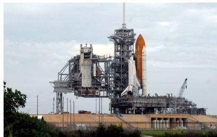
Launch Pad 39-A Cape Canaveral, Florida (1965)