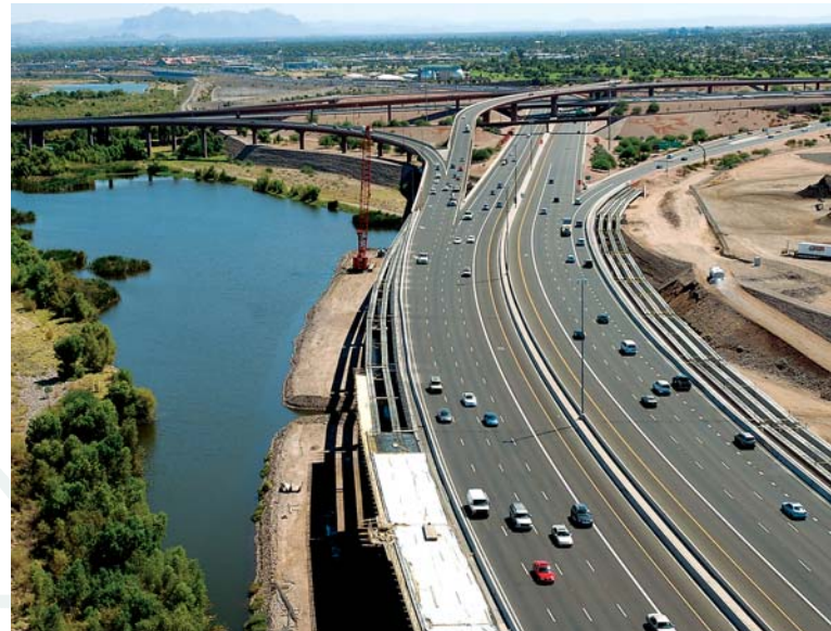
The Loop 202 project includes widening 22 bridges.

Sundt and joint venture partner Kiewit Western are working on a large design-build contract for the Arizona Department of Transportation: the widening of more than 10 miles of the Loop 202 freeway that runs through Phoenix and Tempe. The project will help manage increasing traffic