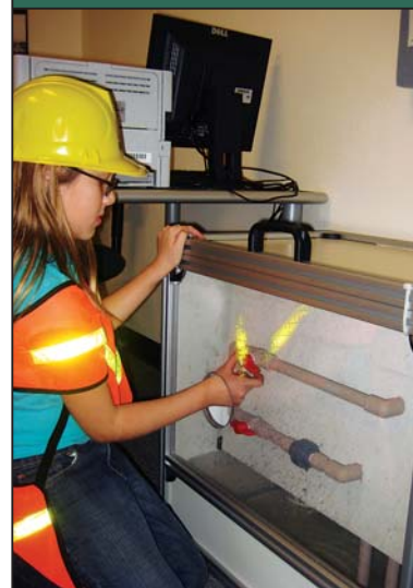
At the construction BizTown, students learn about a variety of industry tasks, from craft work to preparing bids to checking designs.