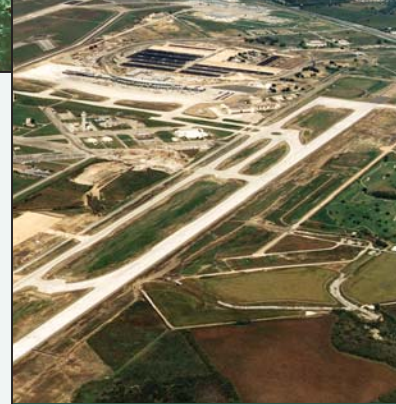
Austin-Bergstrom International Airport

All of this has given me deep roots in Texas and an understanding of the local culture and how to do business there properly. I have been with Sundt for 28 years and I understand the history of the company and our values, which are in concert with the culture of Texas.