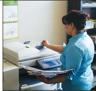
Scanning documents will allow them to be searchable from a database, greatly improving efficiency and accessibility.